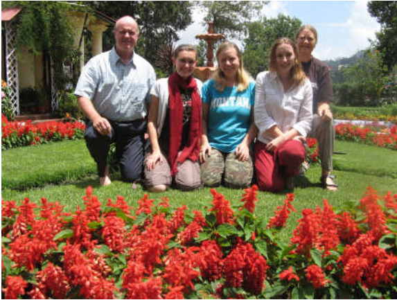
The Guest House in Montauban

We came back to India and spent six days on holiday in a hill station in India while the rest of India burned in the summer sun of 45°