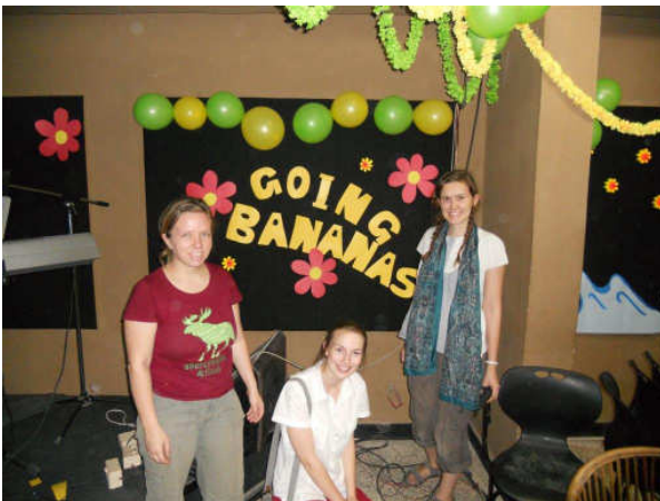
The church decorations

Unfortunately, they arrived too late and we had to wait for another flight twelve hours later. We stayed with friends in Chennai and gave some much needed help decorating their church for a children’s mission.