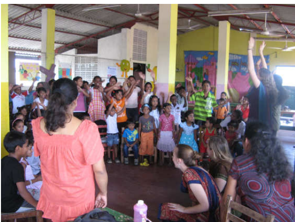
The girls at Sunday School in Sri Lanka