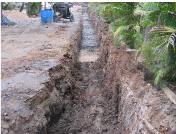
The drainage system half floored

The campus is in upheaval at the moment as the drainage system long needed here is being installed. So far God has held off the forecasted monsoon rains and the cement floor and sides are now firmly in.